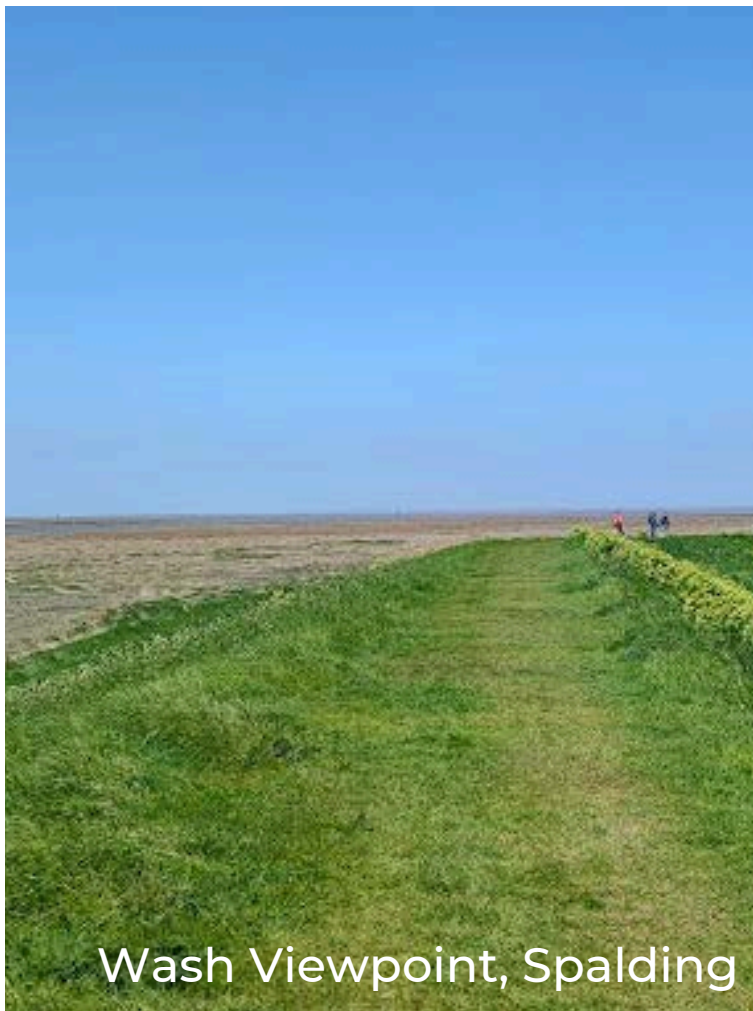
Wash Viewpoint, Spalding

A visit to the coastline offers long walks at Wash Viewpoint, a must for bird watching. The area offers spectacular view over the wash coast, an outstanding shallow bay where seals can often be seen in the summer months with their pups!