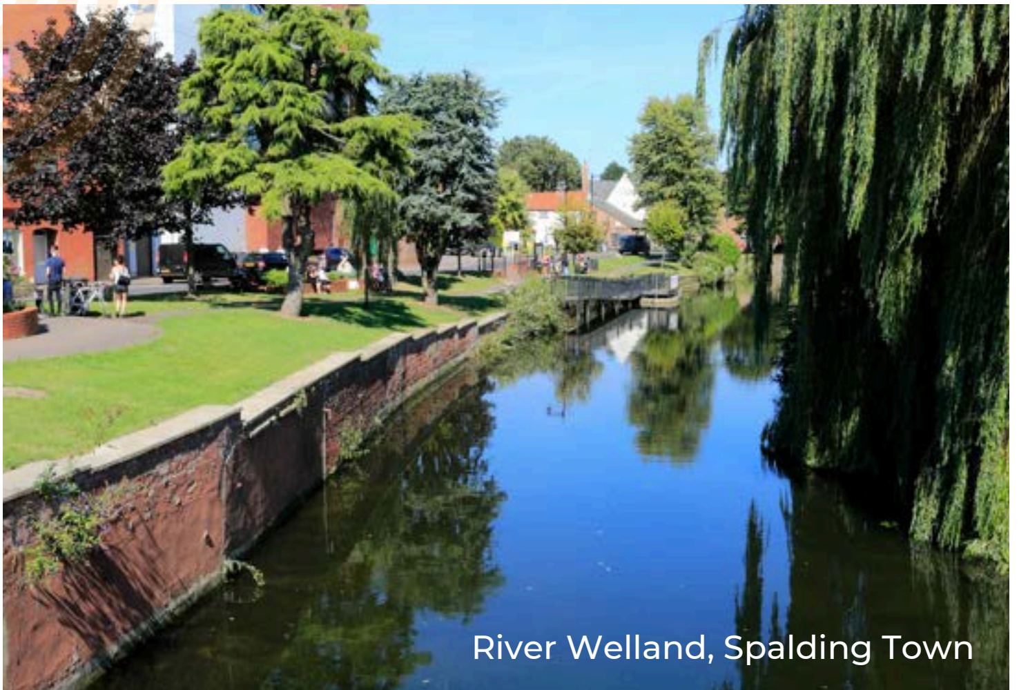
River Welland, Spalding Town