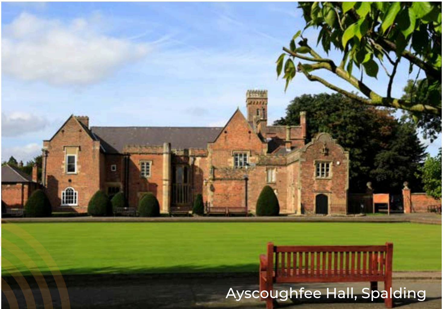
Ayscoughfee Hall, Spalding