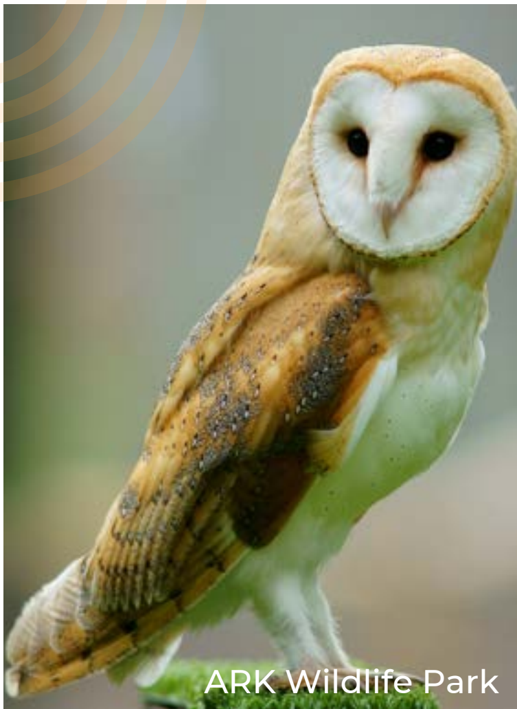
ARK Wildlife Park

Serenity Lakes Lodges is located a short drive to stunning beaches, fishing villages, famed restaurants and local attractions. An abundance of offerings for the whole family from fun days out at a wildlife park to visiting Tallington Lakes Leisure Park, an outdoor activity centre with 205 acres of clean spring water fed lakes.